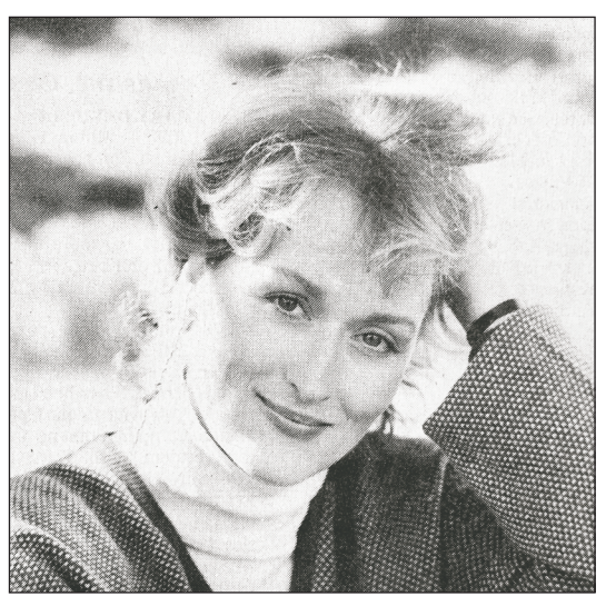
Meryl Streep featured in article on spreading awareness on pesticide use in agriculture, from The Lakeville Journal issue of Feb. 2, 1989.