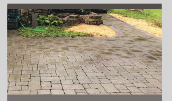
LANDSCAPING Terrace and Walk Installation Tree and Shrub Supply and Planting Lawn Installation Retaining Walls