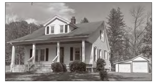
Amenia - 78 Old North Rd: Discover the charm of this delightful country home, complete with a host of desirable features. Step onto the inviting front and back porches, explore the two spacious second-level bedrooms enjoy the convenience of 1.5 baths, relax in the den or dine in the formal dining room and eat-in kitchen. The expansive living room offers ample space for gatherings, while the full usable basement and two-car garage with additional workshop or studio space provide versatility. The lush yard is a haven for gardens and pets, enhancing the country lifestyle. While the home boasts remarkable curb appeal and a rustic charm, a few updates could elevate its allure even more, although it is currently move-in ready. Conveniently located just minutes from the Metro North's Wassaic Train Station, the picturesque Harlem Valley Rail Trail, and charming towns like Millerton, Millbrook, and Sharon, CT, as well as local farm markets and stands, this property offers the perfect blend of peaceful country living and modern amenities. Immerse yourself in the country living experience by scheduling a personal viewing of this well-constructed home. Offered @ $339.000