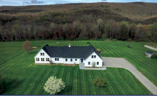
MAGNIFICENT NATURAL SETTING Salisbury, CT • $2,245,000 3,945 sq.ft. | 3 acres | 4 BRs | 3 FBs | 1 HB Double-height great room, reclaimed wood beams EH#5311 • Elyse Harney Morris & Anne Lyndon Peck