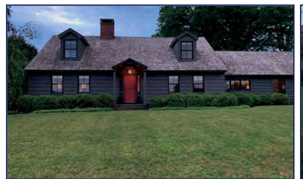
CAPE WITH POOL & TENNIS COURT Salisbury, CT • $2,595,000 3,593 sq.ft. | 3.76 acres | 3 BRs | 3 FBs Renovated Pool House, new bluestone patio EH#5277 • Elyse Harney Morris & Thomas Callahan