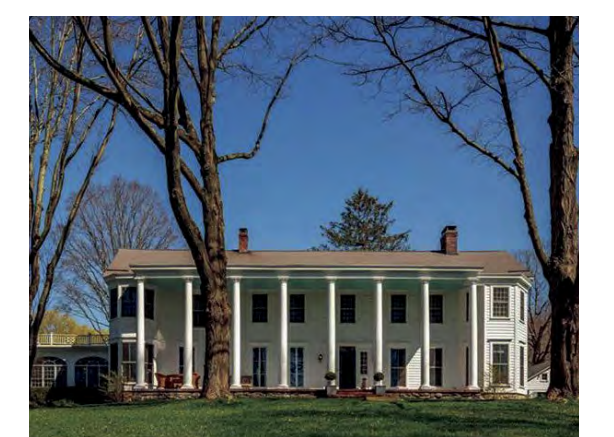
1709 Bulls Head Road Clinton Corners, NY $2,495,000 | 4 BD | 3.1 BA | 4,456 SF | 11.62 Acres