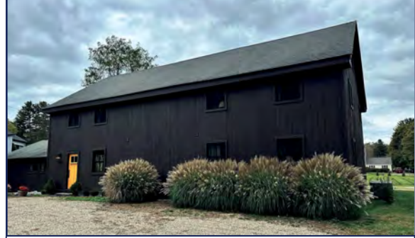
MULTI-USE PROPERTY Salisbury, CT • $1,850,000 4,156 sq.ft. | .46 acres | 4 BRs | 3 FBs | 1 HB Recently renovated, 3-Bedroom Farmhouse with a Garage EH#5143 • Juliet Moore & Thomas Callahan