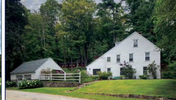
CHARMING HISTORIC SALTBOX Cornwall, CT • $1,295,000 2,236 sq.ft. | 10.00 acres | 4 BRs | 3 FBs | 1 HB Private, two barns, stonewalls, detached 2-car garage EH#5252 • Colleen Vigeant

MAIN OFFICE: SALISBURY, CT 860-435-2200 • MILLERTON, NY 518-789-8800