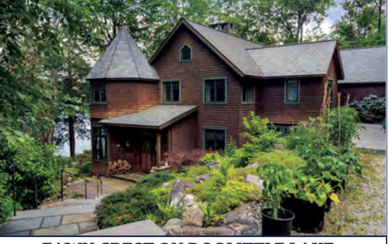
FAWN CREST ON DOOLITTLE LAKE Norfolk, CT • $3,995,000 4,826 sq.ft. | 7 acres | 4 BRs | 4 FBs | 1 HB Privately located with 800' of direct water-frontage EH#5320 • Thomas McGowan