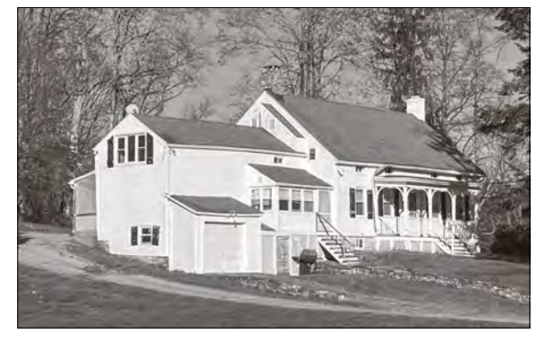
North East/Millerton: Step into the timeless allure of an 1890 Eyebrow Colonial a 5-bedroom, 2-bath gem that surprises with its spaciousness and boasts remarkable wide board floors. This home offers ample space for gardens, pets, and children to frolic. The Metro North Wassaic station is a mere 10 miles away, granting access to the vibrant yet serene lifestyle of Eastern Dutchess County. With its character-filled interiors, this residence captures the essence of charm and a distinctive quality of life. Engage in countryside delights like skiing, biking, hiking, top-notch dining, and the Millerton Movie House all just a short drive away. Discover this inviting home and its location, minutes from downtown Millerton. Now Offered @ $359,000