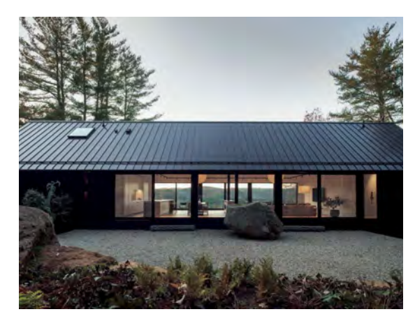
47 Dark Entry Road Cornwall, CT $3,000,000 | 3 BD | 2 BA | 2,520 SF | 5.90 Acres

thehvteam@compass.com hvteamatcompass.com Ø hudsonvalleyatcompass