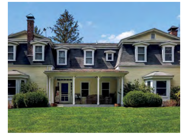
88 Friar Tuck Road Ancramdale, NY $2,300,000 | 5 BD | 3.1 BA | 3,804 SF | 21.50 Acres