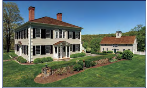
COUNTRY COMPOUND Sherman, CT • $2,185,000 4,074 sq.ft. | 12.61 acres | 4 BRs | 3 FBs 10-ft ceilings, 5 fireplaces, 1000+ bottle wine cellar EH#5272 • Elyse Harney Morris & Liza Reiss