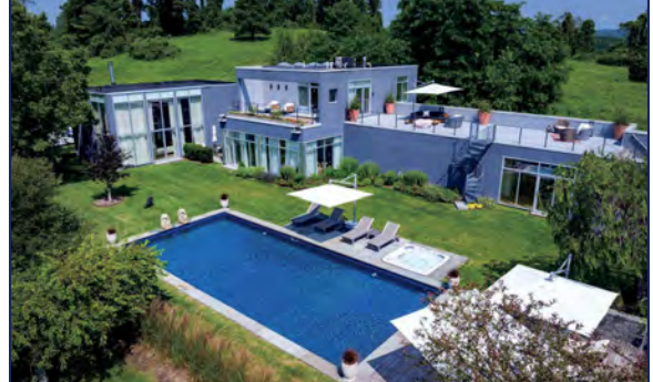
ULTIMATE LUXURY LIVING Hillsdale, NY • $3,700,000 5,635 sq.ft. | 10.46 acres | 4 BRs | 4 FBs | 2 HBs Great Room with fireplace and floor-to-ceiling windows EH#5081 • Elyse Harney Morris & Bill Melnick