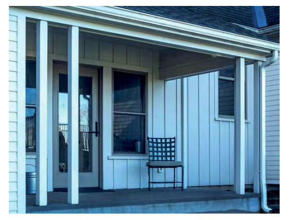
625 Smithfield Road Millerton, NY $895,000 | 4 BD | 2 BA | 2,016 SF | 22.5 Acres