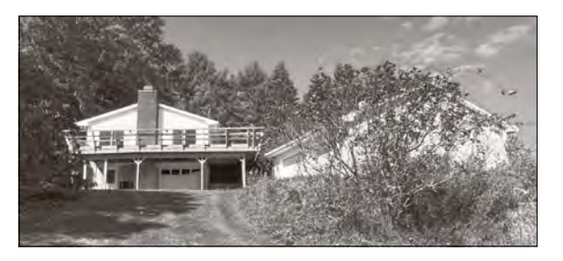
Smithfield Moadock Rd: The picturesque locale of this residence, is embraced by rolling hills and bathed in sunlight throughout the day. Tucked away on 5 acres of unspoiled countryside, this inviting country cottage ensures both comfort and privacy. With mature trees on the North side providing a shield and a wrap-around deck accessed through sliding glass doors, the natural surroundings enhance the charm. The main living level boasts 2 bedrooms, 2 full baths, a captivating great room with a cathedral ceiling, and a striking brick fireplace. The lower level adds versatility with a spacious family room, ideal for a bed or home office, accompanied by a convenient bathroom with a shower. A one-car garage under the house and a standalone two-car garage present additional possibilities, whether for storage or conversion into a studio or workshop. Smithfield's energy and atmosphere are invigorating, while its proximity to Millerton, Amenia, Pine Plains, the Harlem Valley Rail Trail, and the Metro North's Wassaic Train Station adds convenience. The region, with its riding stables and shooting preserves nearby, captures the essence of country living. The tranquility and invigoration contribute to the allure of retreat. Offered @ $490,000. Or on 10 acres @ $735,000.