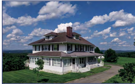
CLASSIC AMERICAN FARMHOUSE Sheffield, MA • $1,825,000 2,840 sq.ft. | 10.23 acres | 4 BRs | 5 FBs Panoramic vistas over protected land, pool, detached garage EH#5325 • Bill Melnick & Elyse Harney Morris