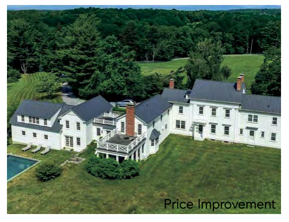
2 Bontecou Road Millbrook, NY $4,499,000 | 6 BD | 5.3 BA | 5,742 SF | 28.7 Acres