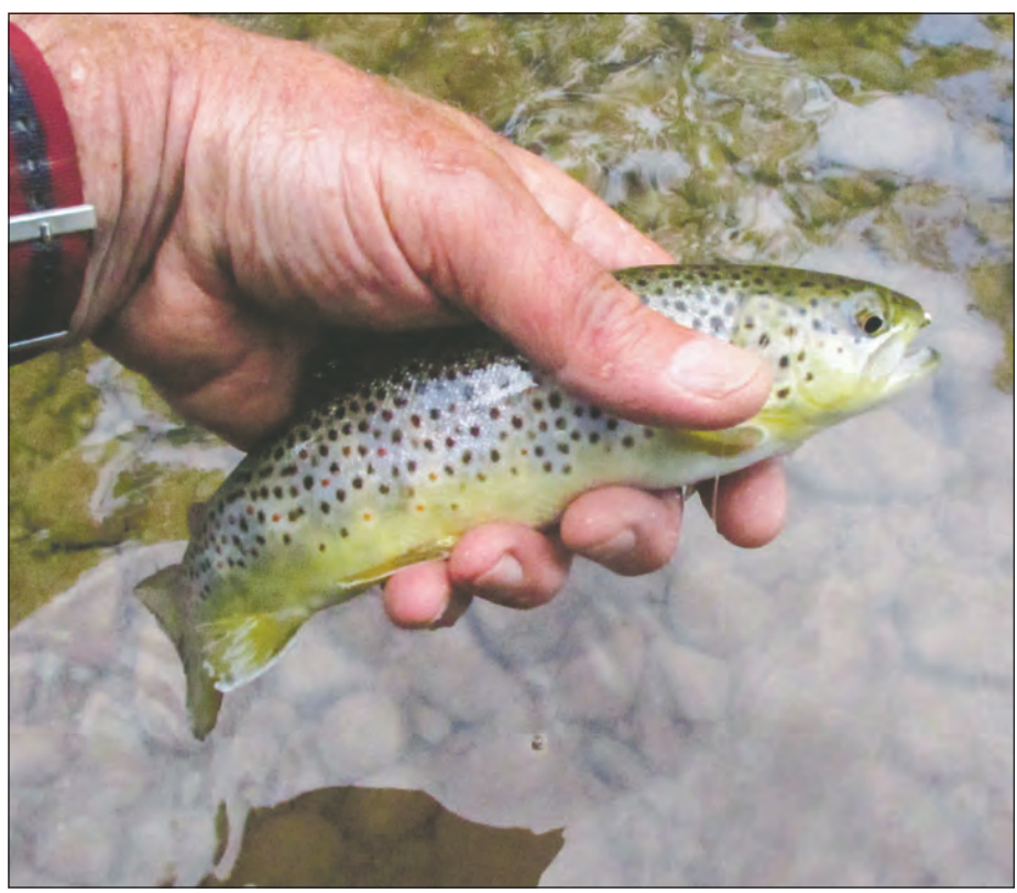
The catch of the day for the Tangled column of the week.