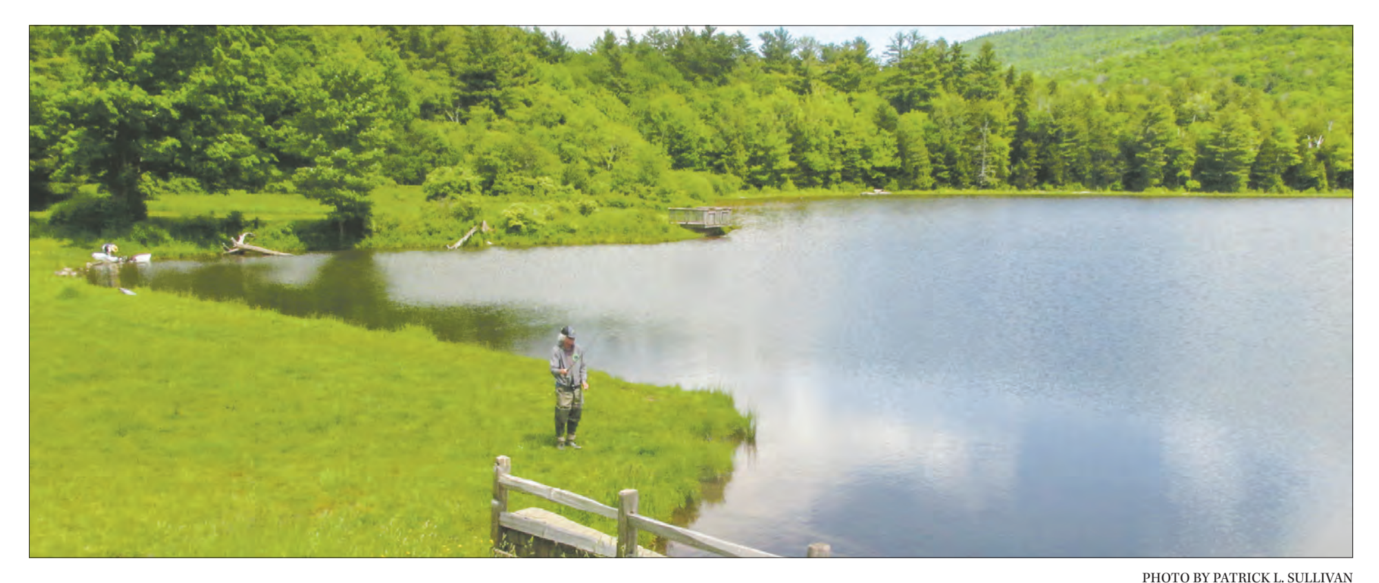
an weith the suprementation of the

The guru in action in his natural habitat: the slow wait by the watery depths.