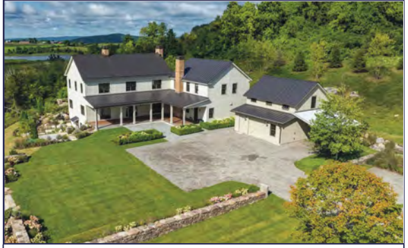
FARMHOUSE WITH EPIC VIEWS

Millbrook, NY • $6,785,000 5,162 sq.ft. | 51.86 acres | 5 BRs | 5 FBs | 1 HBs Sun-filled rooms, gourmet kitchen, sunroom, gunite pool EH#5430 • Bill Melnick & Elyse Harney Morris