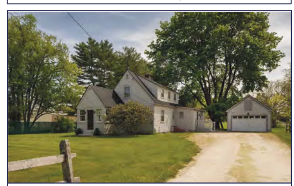
COZY EDGE-OF-TOWN FARMHOUSE

North Canaan, CT • $545,000 3,549 sq.ft. | 0.43 acres | 1 FBs | 1 HBs Large lot, off-street parking, and multiple entry points EH#5424 • Holly Leibrock & Elyse Harney Morris