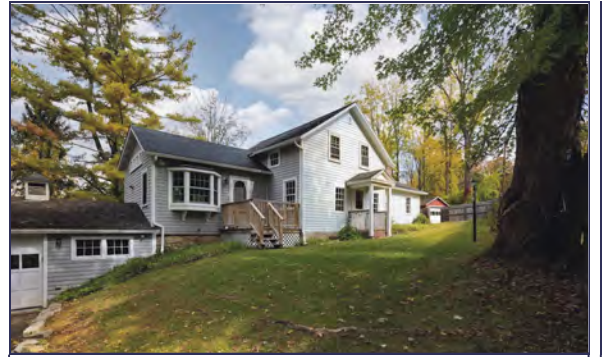
CENTRALLY LOCATED ANTIQUE FARMHOUSE

Salisbury, CT • $550,000 1,714 sq.ft. | .50 acres | 3 BRs | 1 FB | 1 HB Detached garage, Commercially Zoned edge-of-town location EH#5357 • Juliet Moore