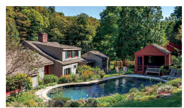
Kent, CT ENCHANTING ANTIQUE ON 5.5 ACS $998,000 | 3 BEDS | 2/1 BATHS