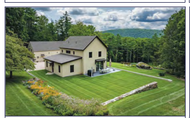
PRIVACY & PERFECTION

Watertown, CT • $4,195,000 7,924 sq.ft. | 100.70 acres | 8 BRs | 7 FBs | 2 HBs Views, trails, waterfront cabin w/ dock, Pool house w/ indoor pool EH#5431 • Liza Reiss & Elyse Harney Morris