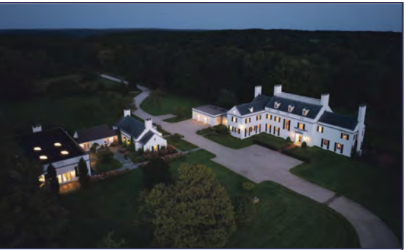
VIEWS, WATERFRONT AND SUNSETS!

Salisbury, CT • $4,750,000 4,548sq.ft. | 43 acres | 4 BRs | 3 FBs | 1 HBs Private, winding driveway, 300-degree vista, bluestone patio EH#5418 • Bill Melnick & Elyse Harney Morris