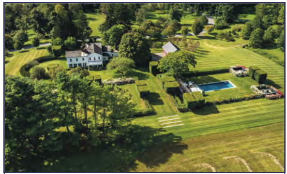
EXQUISITELY RESTORED 1822 FARMHOUSE

Millbrook, NY • $6,785,000 5,162 sq.ft. | 51.86 acres | 5 BRs | 5 FBs | 1 HBs Sun-filled rooms, gourmet kitchen, sunroom, gunite pool EH#5430 • Bill Melnick & Elyse Harney Morris