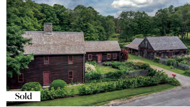
Warren, CT OFFERED AT $1,795,000 REPRESENTED SELLER