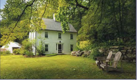
ANTIQUE SALTBOX C. 1781

West Cornwall, CT • $1,925,000 2,540 sq.ft. | 1.19 acres | 2 BRs | 4 FBs Fully renovated w/ gardens and views, 3-season room EH#5422 • Bill Melnick