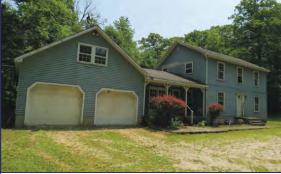
OPPORTUNITY AND VALUE

Sharon, CT • $795,000 2,300 sq.ft. | 25 acres | 4 FBs | 2 FBs | 1 HB Large barn with a 3 BR, 2 BA apartment, 12 garage bay EH#5407 • Dave Taylor