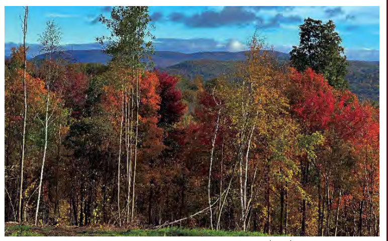
25 ACRES ABUTTING OPEN SPACE $584,000