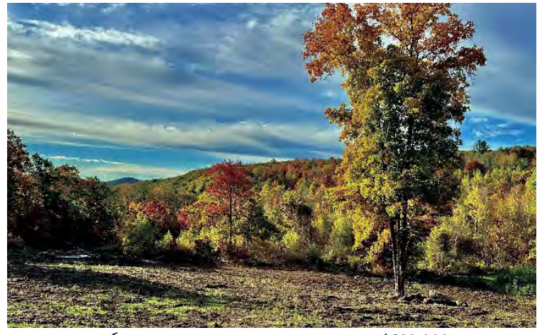
26 ACRES ABUTTING OPEN SPACE $589,000

Either of these two private and protected parcels in Sharon can be yours